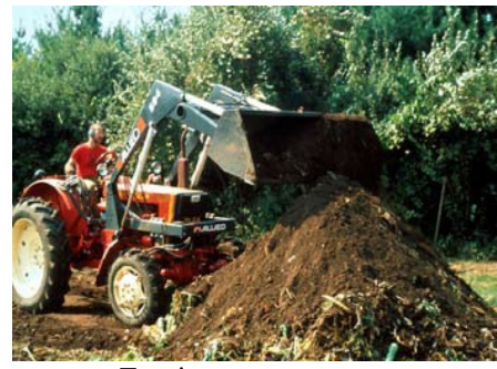
Turning your compost